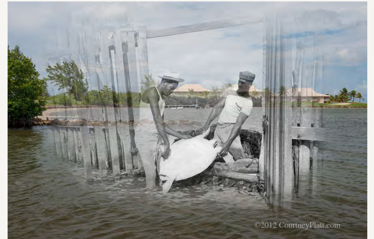
Fishing and Turtling