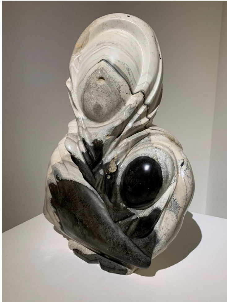
Horacio Estaban, Mother and Child II , 2017. National Collection of the Cayman Islands.