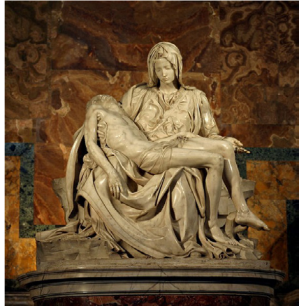
Michelangelo, Pieta, c. 1498-1500, marble