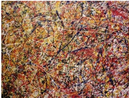
Jackson Pollock, Drip Painting , 1951