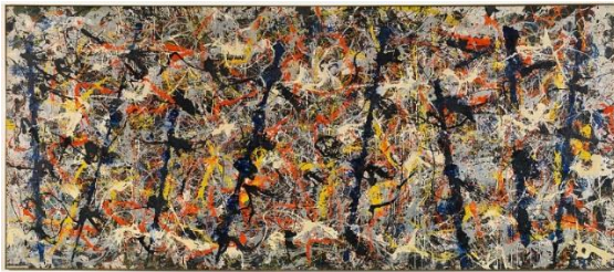
Jackson Pollock, Blue Pools , 1952