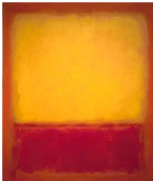
Mark Rothko, Yellow Over Purple , 1956