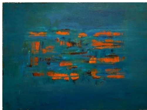
Bendel Hydes, Untitled , 1988

“What I am striving for is to discover new ways of seeing the world. What the untrained eye might see as abstraction is nothing but a new vehicle by which to represent reality” (Bendel Hydes)