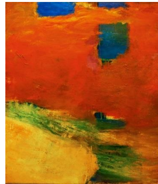
Bendel Hydes, Interior , 1989