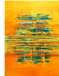
Bendel Hydes, The Ledges , 1994