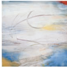
PLATE 135 The Crossing (Circumnavigating the Globe No. 11), 2010 Oil on canvas, 78 x 78 inches Collection of Alan and Karen Turner