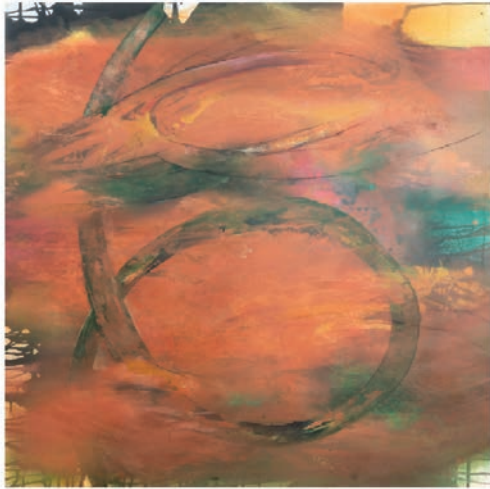
PLATE 132 Emergence (Circumnavigating the Globe No. 7), 2009 Oil on canvas, 78 x 78 inches Collection of Alan and Karen Turner