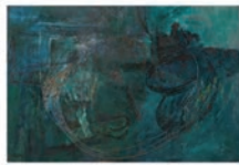
PLATE 137 The Crossing (Circumnavigating the Globe No. 12), 2010 Oil on canvas, 78 x 78 inches Collection of Alan and Karen Turner