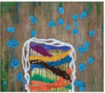
PLATE 136 Emergence (Circumnavigating the Globe No. 9), 2009 Oil on canvas, 78 x 78 inches Collection of Alan and Karen Turner