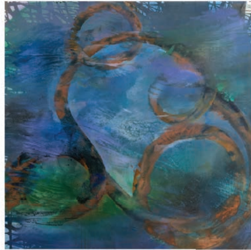
PLATE 133 The Crossing (Circumnavigating the Globe No. 10), 2010 Oil on canvas, 78 x 78 inches Collection of Alan and Karen Turner