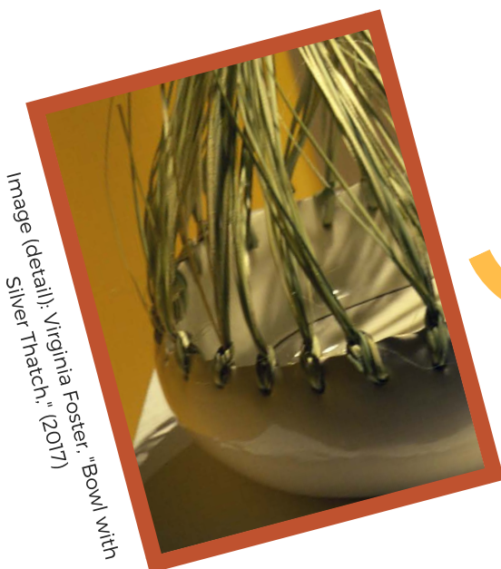
Image (detail): Virginia Foster, "Bowl with Silver Thatch," (2017)