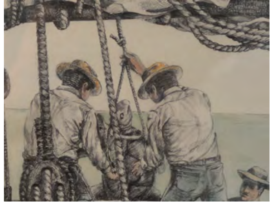
D.E. Freeby. Untitled (detail). 1990.

★ LOOK closely at this drawing. What do you see? What do you think the fishermen are doing?