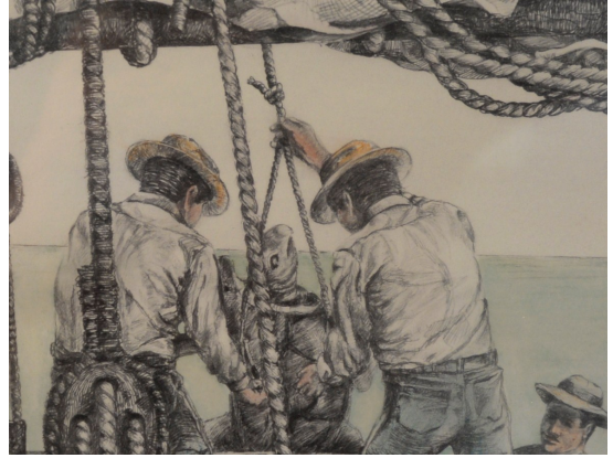
D.E. Freeby. Untitled (detail). 1990.

★ FIND the original drawing that this detail is taken from. What is the artist's name?