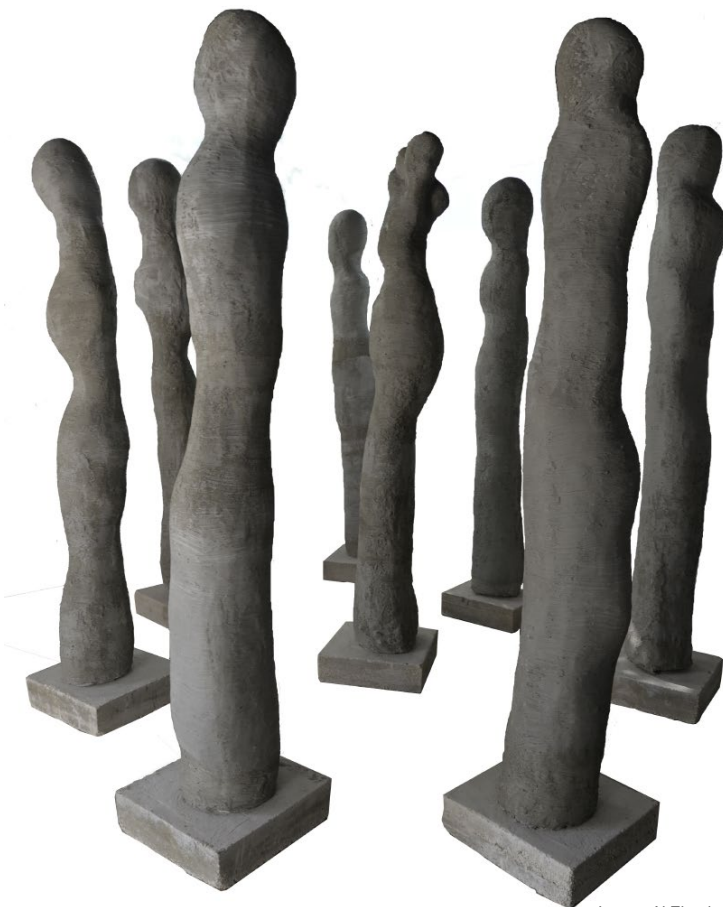
Image: Al Ebanks, 2016, Together We Stand , from the collection of the artist

★ LIST the materials the artists have used to create these works of art.