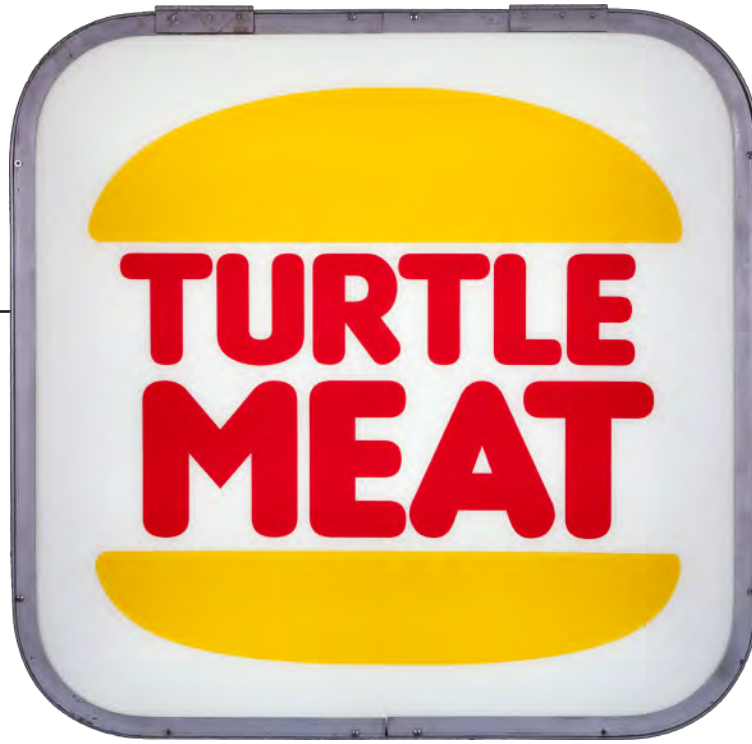
Image: Wray Banker (2015), Our Way 1994-99 from the collection of the artist