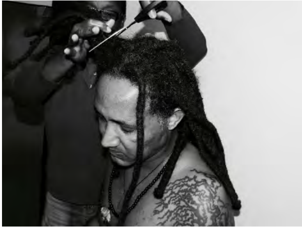
Image: Sean Ebanks (2015), Neither Fish Nor Flesh (detail) from the collection of the artist