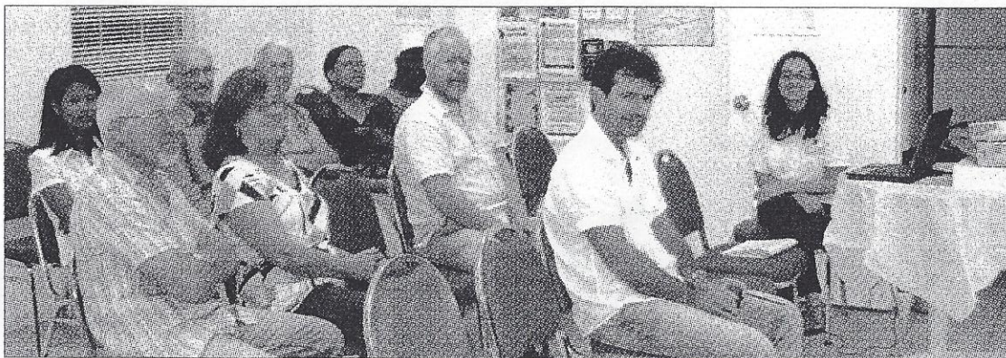
NGCI travelling art lecture, Heritage House, Cayman Brac.