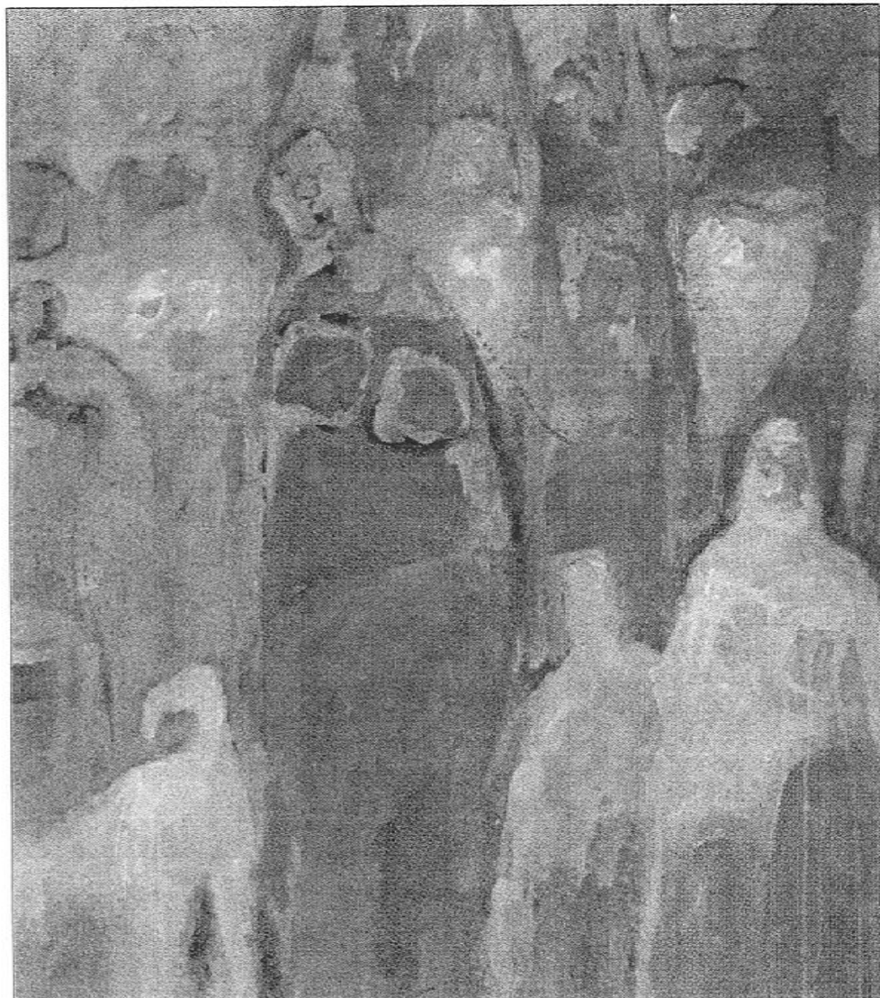
Summer Daze I by Renate Seffer.

If you have ever wanted to see an artist in action, the upcoming artist-in-residency programme facilitated by the National Gallery will give you the chance to do just that.