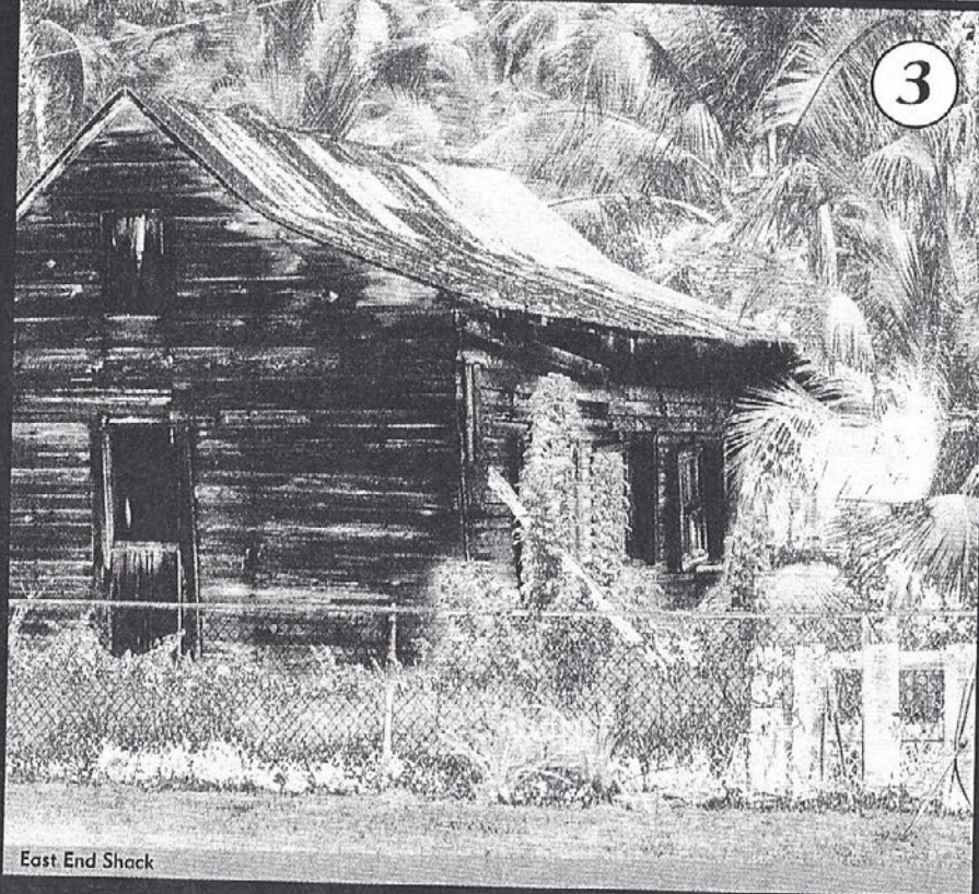
East End Shack