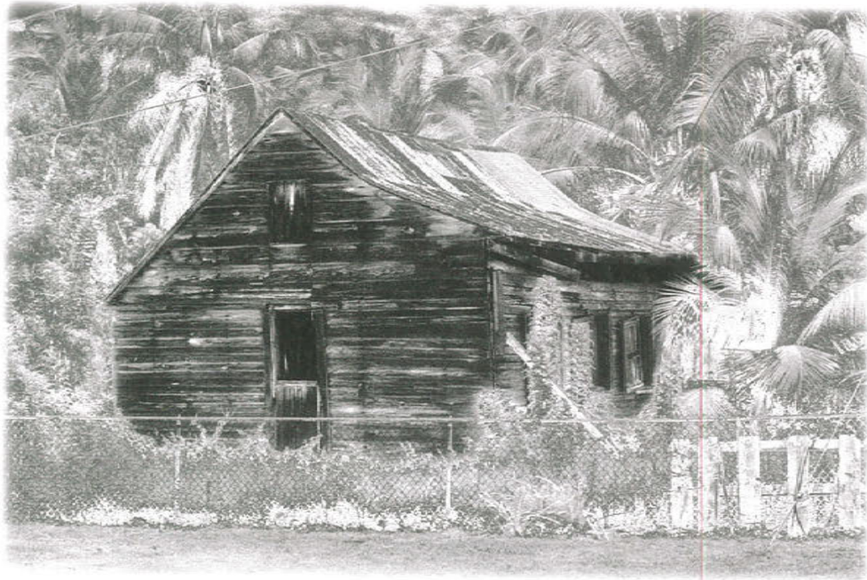
House of Sam, East End, 1986