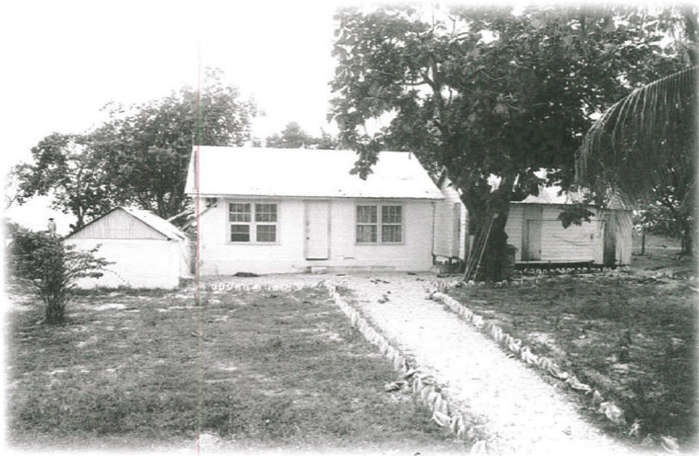
Gramma Julia's, West Bay, 1982

Gramma Julia's had the basics required for shelter. Cisterns with a bucket connected to a rope was a daily ritual for the water supply, while detached kitchens and outhouses were the standard amenities in those days.