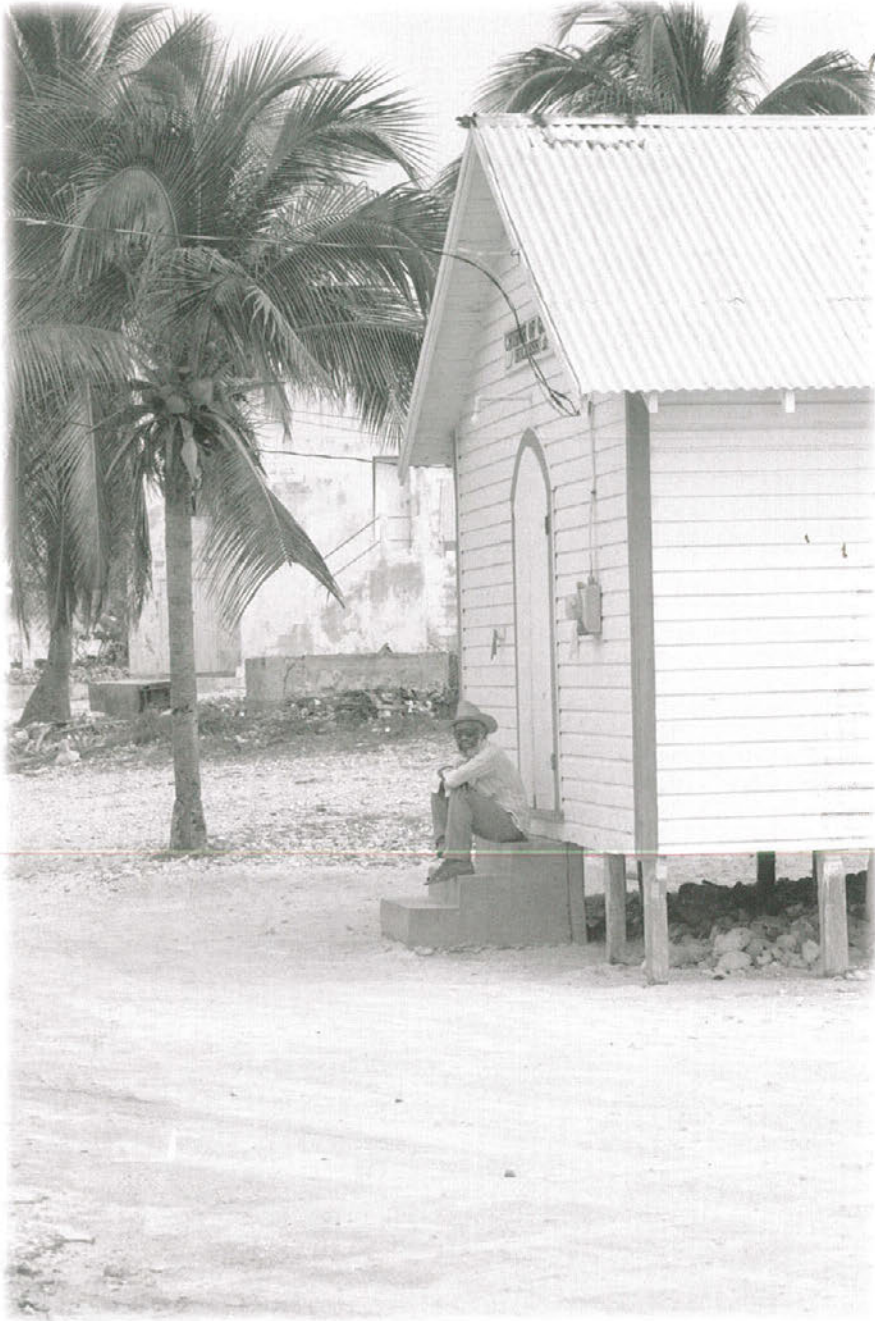
Church of God, Cayman Brac, circa. 1985

All images are copyright. For purchase, please email or call for further details.