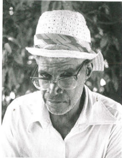
One Eye Willie, 1986