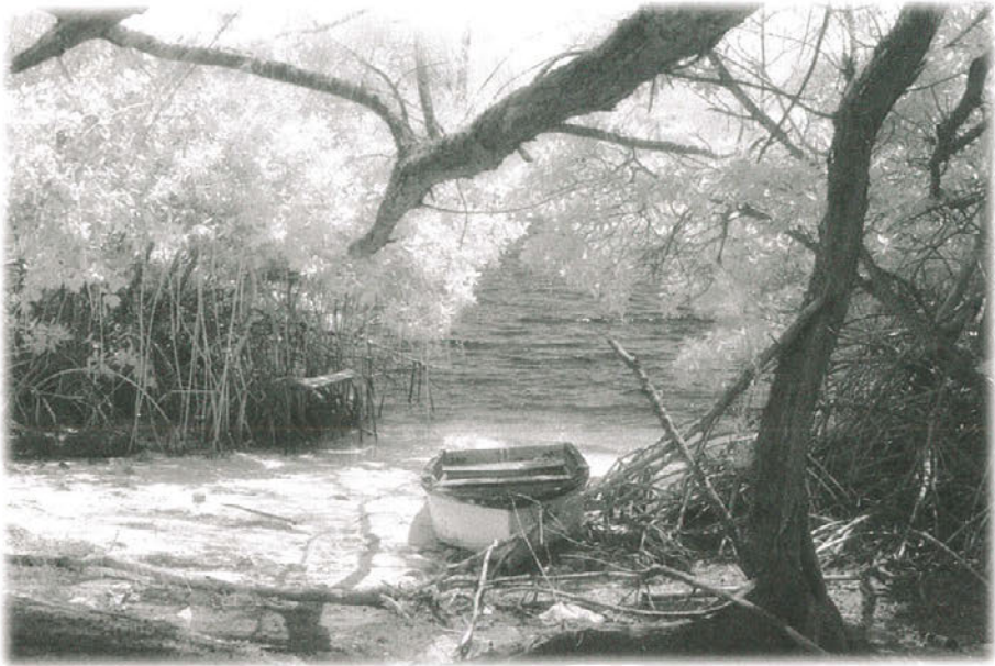
The Hide Away, South Sound, 1987

I have photographed the Cayman Islands for over twenty years. My collection of images are, simply that, a collection. What I have chosen to exhibit is a cross section of the works that I feel should be seen on the premise that