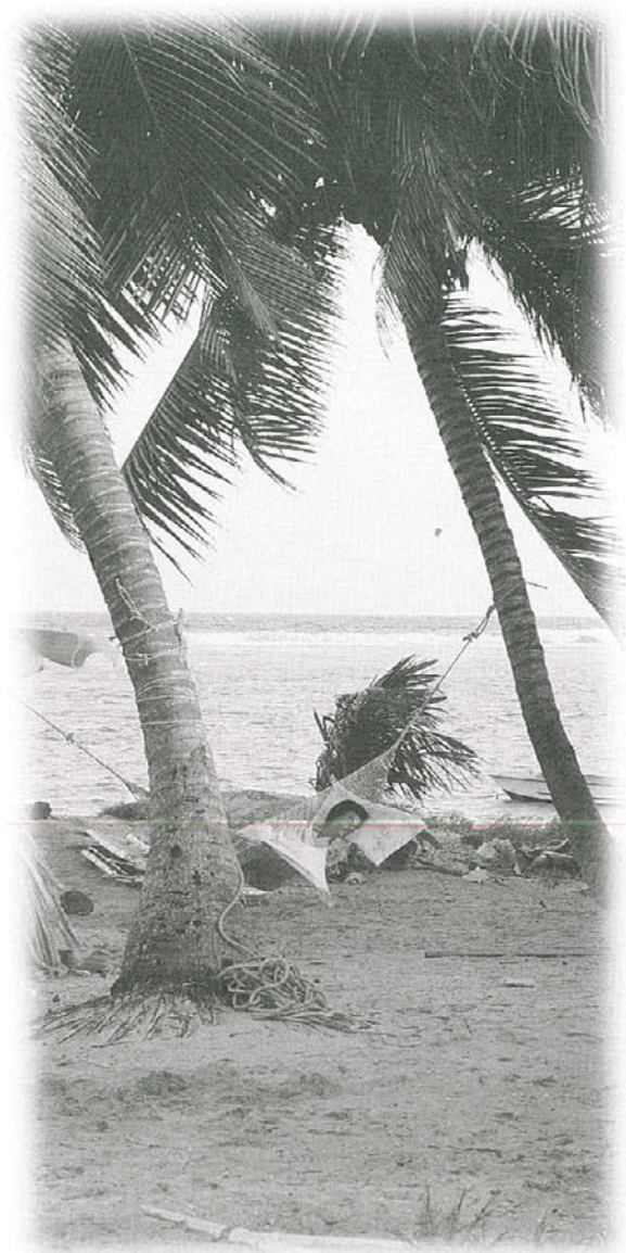
Cayman Life, 1984