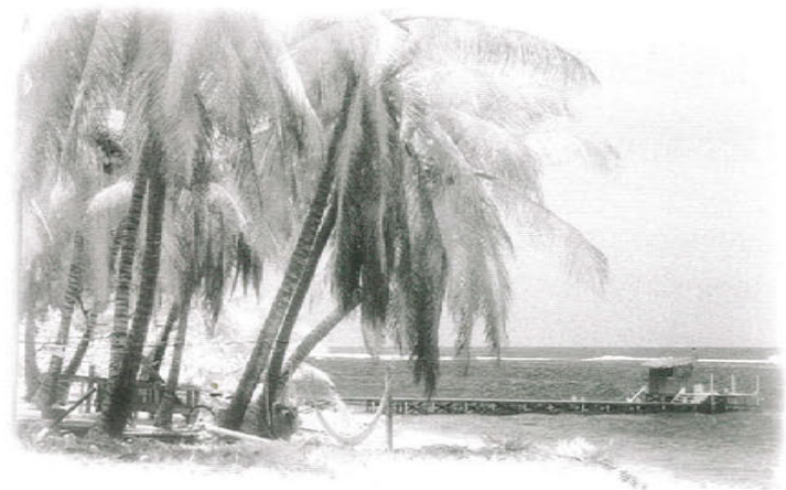
East End Dock, 1987