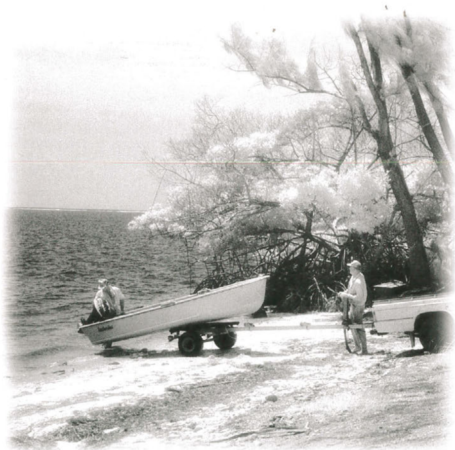
Gone Fishnin', South Sound, 1986