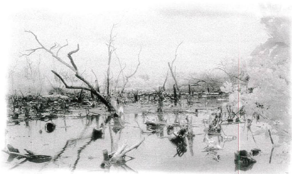
Wet Lands, West Bay, 1987

Alfred Stieglitz once said about photography, "If there is light, there is a picture." His point was that no matter what you are given to shoot, a good photographer will find a good picture in it. You may have to look really hard and get creative, but a picture is there and the challenge is to find it.