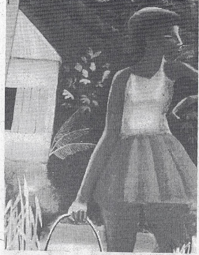
A girl carrying a water-bucket stands in front of a whitewashed structure reminiscent of an old-style Caymanian home.