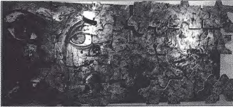
arts of the